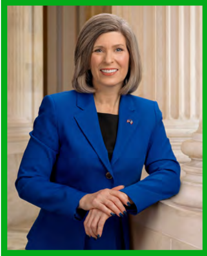
REPUBLICAN - RED OAK